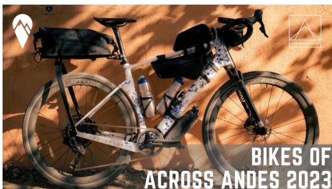
Bikes of Across Andes 2023