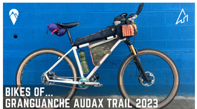
Bikes Of... GranGuanche Audax Trail 2023